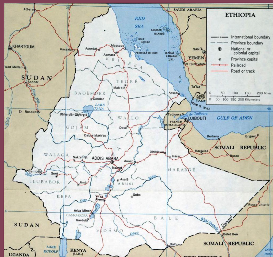
1963 map of Ethiopia

During his rule (1930 - 1974), Emperor Haile Selassie continued to give away Tigrayan land to Amharic-speaking regions. In 1943, Tigrayans rebelled against the imperial regime of Haile Selassie when he wanted to further centralize the government which would remove Tigray's right to self-determination. This movement is known as the First Woyane (Kedamay Woyane).